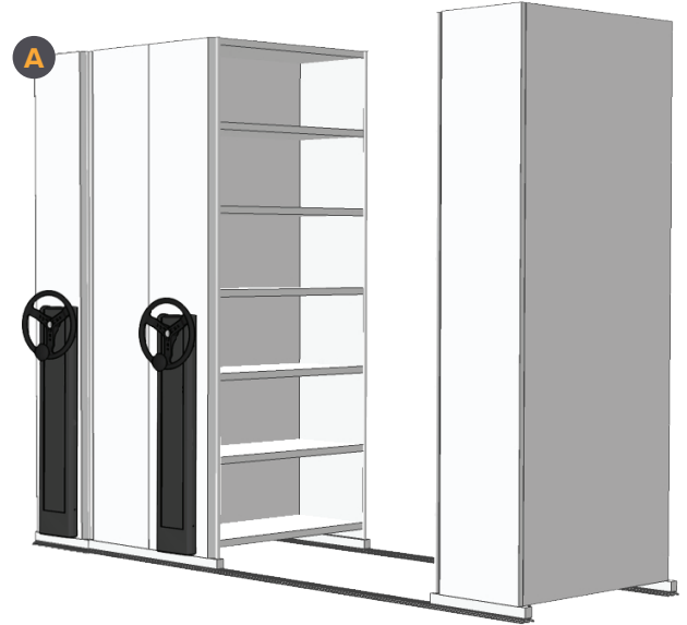
MECHANICALLY ASSISTED SYSTEM